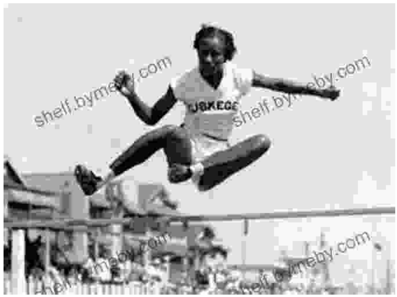
Olympic Glory: Breaking Barriers, Making History

The 1948 London Olympics was a watershed moment for Alice Coachman and for the world of sports. Amidst a backdrop of racial segregation and prejudice, Alice stepped onto the Olympic stage with unwavering determination to smash barriers and make her mark.