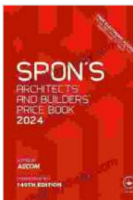
Image Alt: Spon Architects and Builders Price 2024 book cover, featuring a modern building under construction with a cost analysis spreadsheet overlay.

Don't delay, secure your copy of Spon Architects and Builders Price 2024 and elevate your construction costing expertise to new heights.