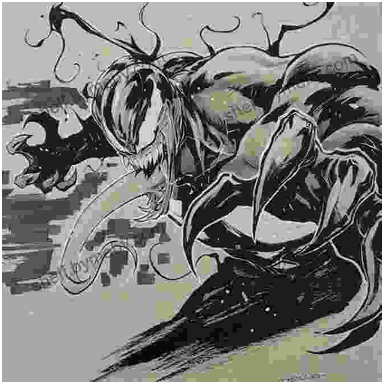
Venom 2024 34 interior art by Iban Coello

Iban Coello's exceptional artwork is a defining element of Venom 2024 34. His dynamic illustrations capture the raw power and ferocity of Venom, while his intricate linework and expressive facial expressions convey the nuanced emotions of Eddie and the supporting cast.